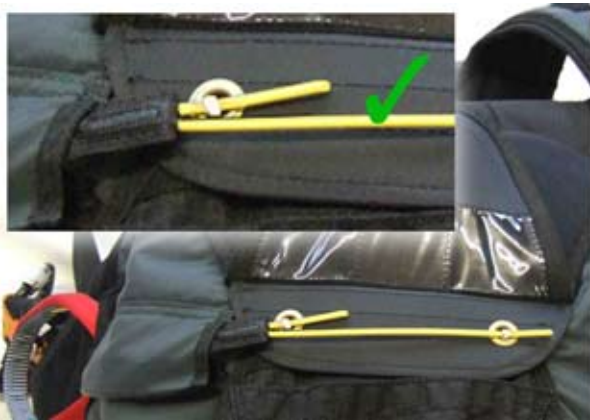
Original reserve handle fitted correctly

A paraglider pilot inadvertently released his reserve while preparing for takeoff - the outer container opened and the inner container fell out. A friend offered help on the spot and put the reserve back in place. While this was being done the longer of the two yellow reserve handle cables was incorrectly routed through both closure loops. Tests show that successful reserve throwing from this situation can only be achieved by a hard pull in a sawing motion. For a correct installation the short yellow cable should go through the first loop – the longer only through the second.