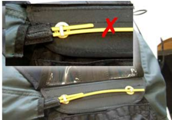
Original reserve handle fitted wrongly