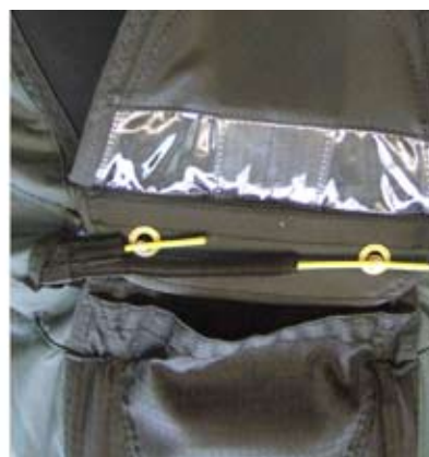
Updated handle fitted correctly